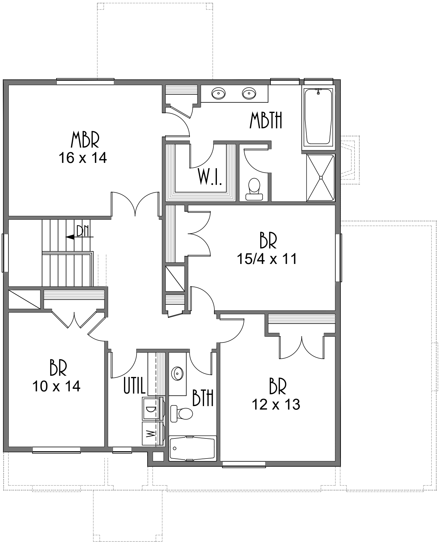
UPPER FLOOR PLAN 1297 SQUARE FEET